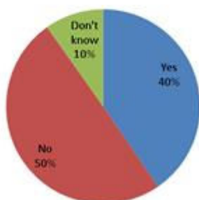
Have you ever been bullied at school or anywhere else?

Bullying questions are also relevant for those being bullied online